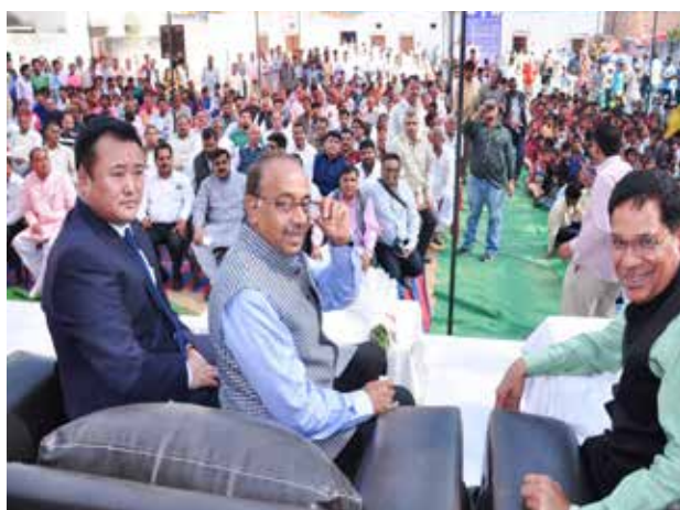
Minister responding to the cheers of the crowd

The participants were also trained on youth participation and leadership for village development so that young people can be agents of change as important partners in village development. Apart from this, RGNIYD RC also organised a Sports Meet for youth, as sports is one of the key connector for youth. Minister