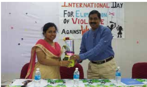
At Rajiv Gandhi College of Engineering