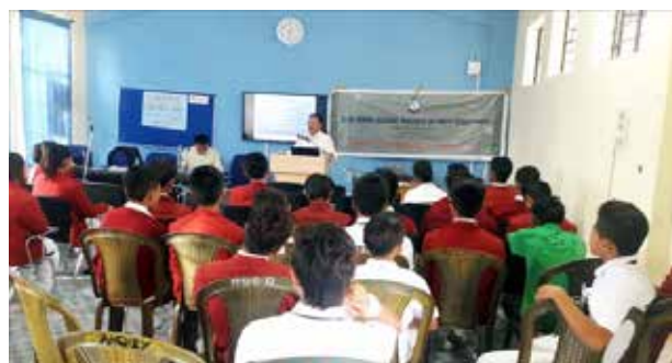
Awareness Workshop on Career Planning in progress