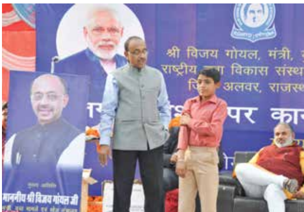
Minister sharing a light moment with a youngster

RGNIYD RC Chandigarh organised a 2-day Training on Employability Skills through Life Skills Approaches and Sports Meet for 600 youth on 25-26 November, 2016 at village Taseeng, Tehsil Behror, District Alwar, Rajasthan. In this training, besides developing the employability skills through life skill approaches, they were also told about various schemes of the overnment for youth development and the process to avail those schemes. The talk enlightened the participants about the government initiatives like Pradhan Mantri Jan Dhan Yojna, Digital India, Skilled India, Make in India, Pradhan Mantri Suraksha Bima Yojana, Start Up Stand Up India etc, motivated and inspired them to take benefit from the government initiatives for themselves as well as for bringing a positive change.