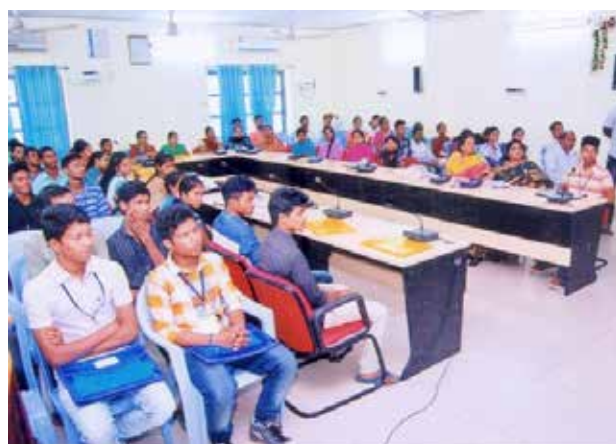
Vice-Chancellor with the young participants