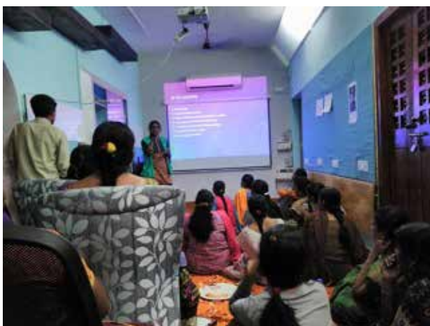
Participants keenly listening at RGNIYD and at PCVC