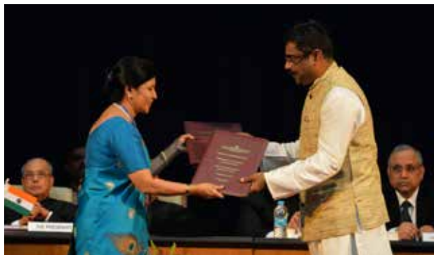
At Visitor's Conference with the Hon'ble President of India looking on at RGNIYD exchanging the MOU with SGIPL

RGNIYD exchanged a MoU with Saint-Gobain India Private Limited (SGIPL) Flat Glass Business in the presence of honourable President of India on 16th November 2016 on the occasion of the Visitor's conference. The main areas identified for collaboration are 1) Strengthening capacities of local communities 2) Collaboration on action research projects 3) Development of industry driven value oriented courses for employees of SGIPL business eco system that nurture diversity among employees 4) Development of CSR field work engagements for students of RGNIYD.