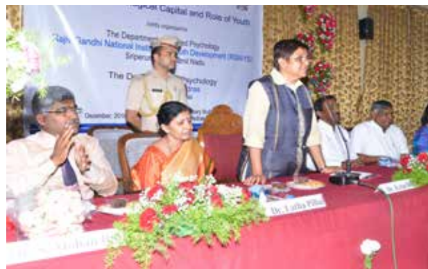
Dr. Kiran Bedi, IPS (Retd.) Hon'ble Lieutenant Governor Government of Puducherry delivering the valedictory address.

16th -17th December 2016, University of Madras, Chepauk Campus