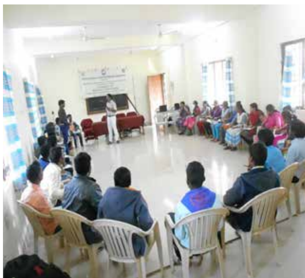
NSS programme officers at Utkal University,

Gender Sensitisation and Legal Awareness Programme for ST youth student volunteers was conducted in Utkal University, Orissa for three days. The programme had lectures on different policies and initiatives regarding personal laws. The interactive sessions included Social construction of Gender, Human Rights and Gender, Prevention of Child Sexual Abuse, Online Violence and Exploitation of Women and Girls, Human Trafficking and Violence against Women and Girls, and Gender and Media. There were a total 40 participants in all.