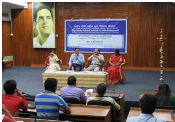
Audience at the Invocation