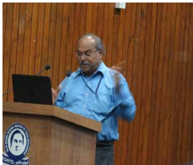
National Integration Week, Weaker Section Day 22-11-2016, RGNIYD