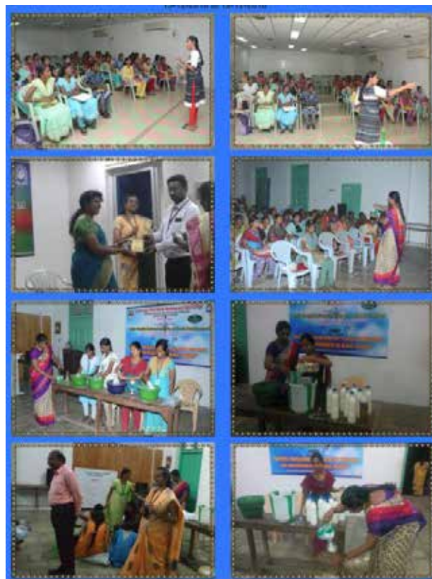
Participants with the various Resource Persons and at the Demo Sessions

A five days residential training programme on “Capacity Building and Empowerment of Rural Women” was held from 15.12.2016 to 19.12.2016 in collaboration with Rajiv Gandhi National Institute of Youth Development, Sriperumbudur. The programme was organized to throw more light on gender sensitization, gender parity, personality development, emotional intelligence, soft skills and economic equality. 42 participants from 7 colleges took part in the training programme.