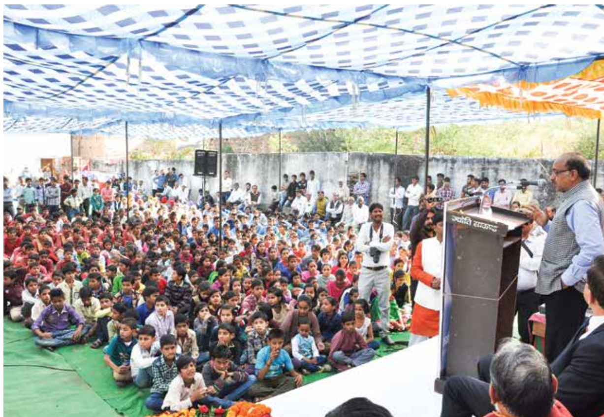
Hon'ble Minister Sh. Vijay Goel, Ministry of Youth Affairs and Sports, Government of India addressing the youth at Taseeng, Rajasthan.