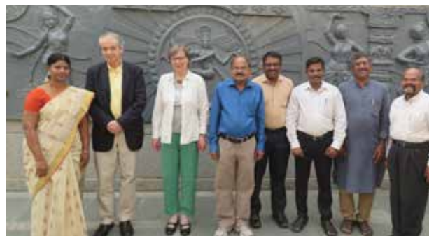
The staff of RGNIYD with the German Delegation