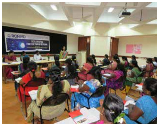
Entrepreneurs listening to hone their skills